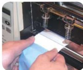
Step 1. Lock Printhead

Clean Start® is an innovative, patented printhead cleaner that's built right into the ribbon. It removes debris before it builds up on the printhead. All it takes is 6 seconds and 2 easy steps.